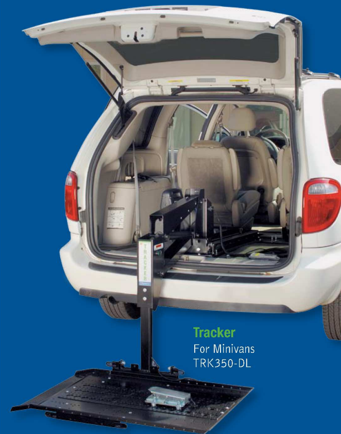
Tracker For Minivans TRK350-DL