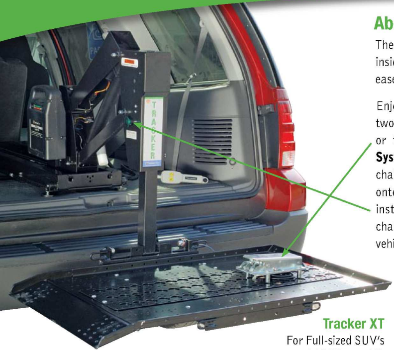
Tracker XT For Full-sized SUV's TRKXT350-DL